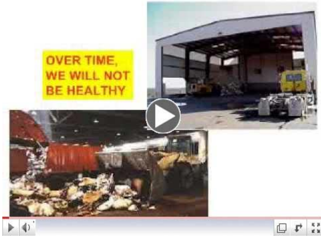
What a Waste Transfer Station Does!